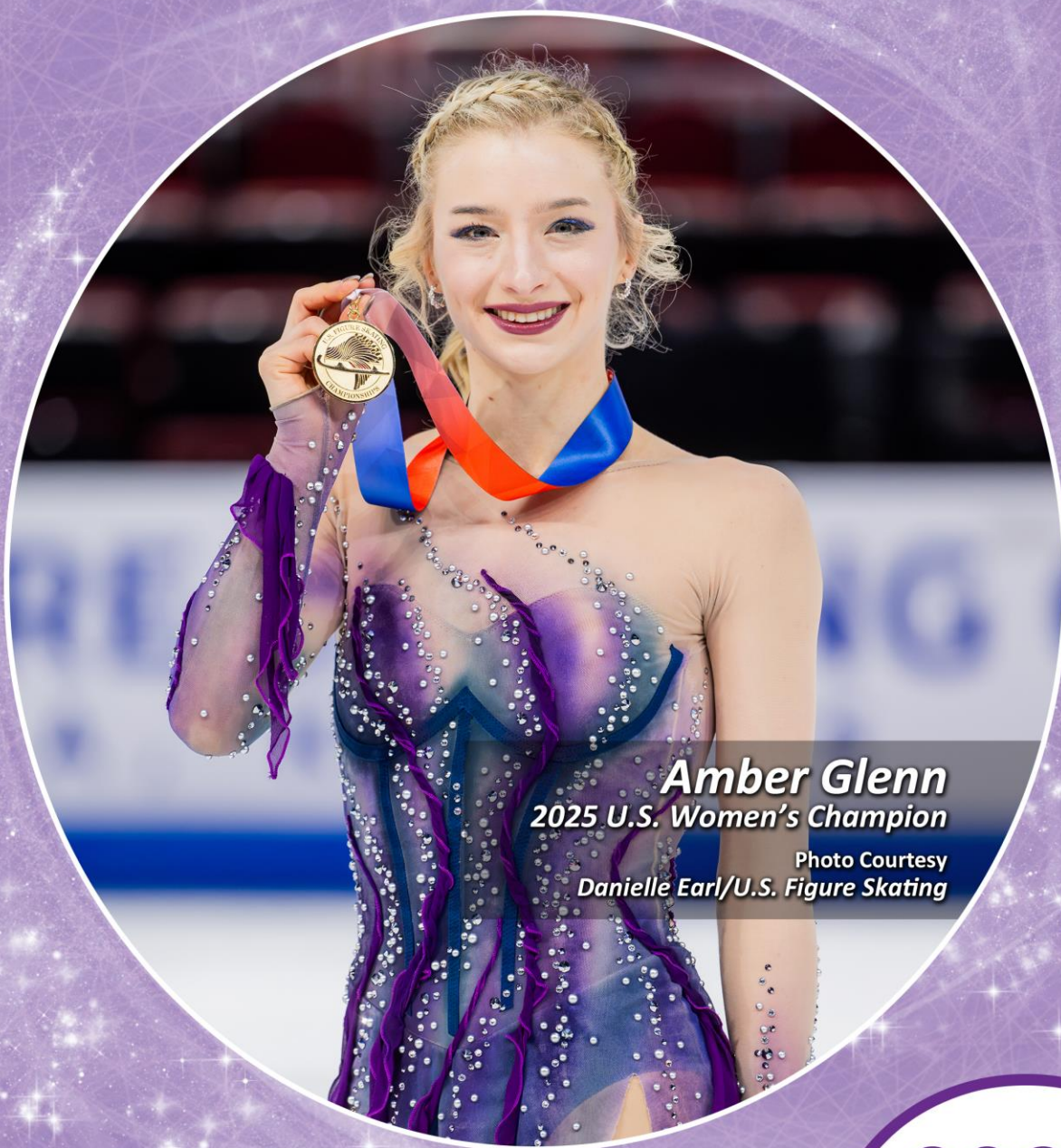
Amber Glenn 2025 U.S. Women's Champion